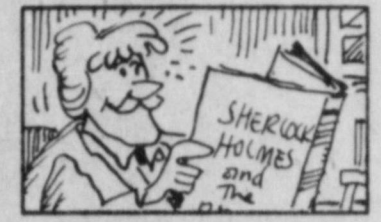
At no point in any of the 56 short stories and four novels that Arthur Conan Doyle wrote about his famous detective does Sherlock Holmes say "Elementary, my dear Watson."