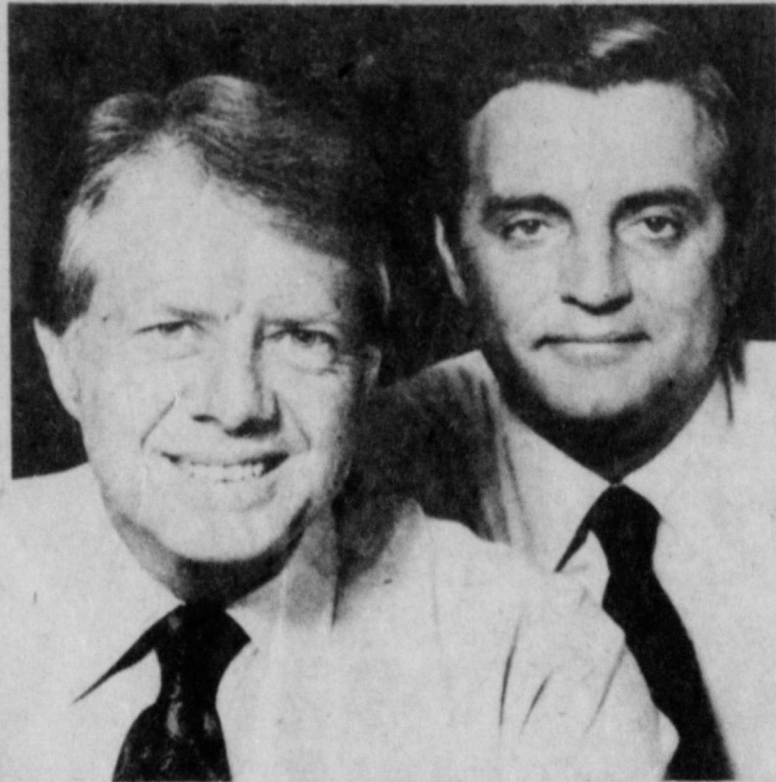
JIMMY CARTER President Elect