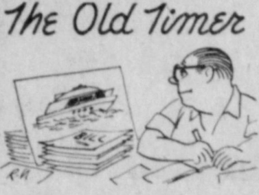
Budget—an attempt to live below your yearnings.

They will be recognized Friday at the homecoming game during the half-time show.