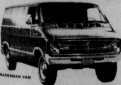
DODGE TRUCKS — BUILT TOUGH FOR THE MAN WITH A JOB TO DO.