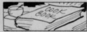
Cookbooks, along with Bibles, were among the earliest books printed and still outsell any other kind of books.

The last day of school for the seniors will be Thursday, May 20. The baccalaureate service is set for Sunday 23, at 8:00 p.m. in the high school auditorium. Also in the auditorium on May 25, at 8:00 p.m. will be graduation.