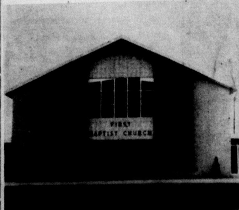
NEW SIGN: Shown above is the new sign recently erected at the front of the First Baptist Church building. The new black lettering is very attractive and adds to the appearance of the building.