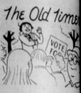
"He's master of the th in politics-promises, pro promises."