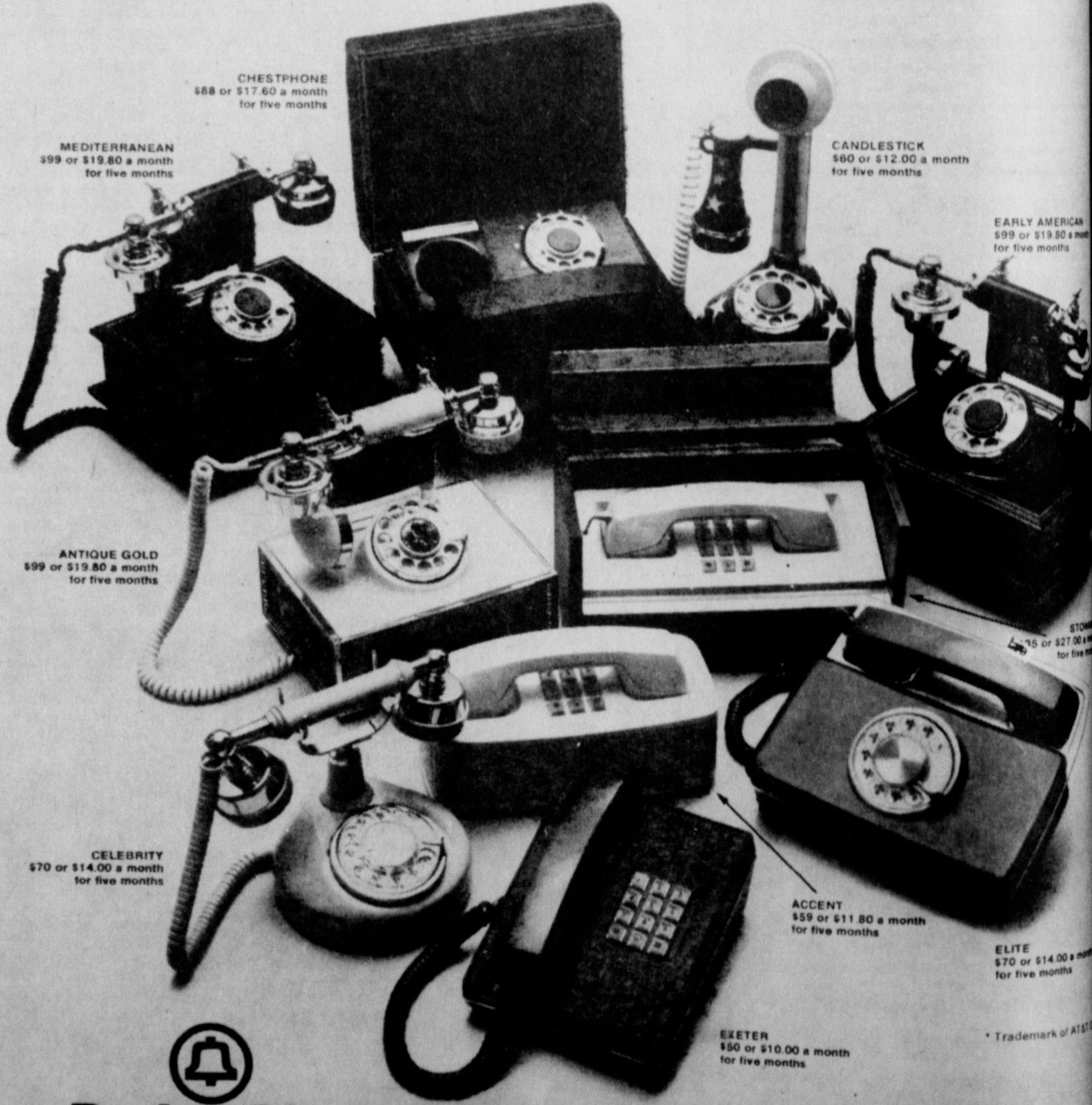
CHESTPHONE $88 or $17.60 a month for five months

months without interest. To assure quality phone service, the working parts (dial, cords and electrical components) remain our property and responsibility. So anytime these parts need repair, we'll fix them without additional charge. To order or for more information, call your Southwestern Bell business office.