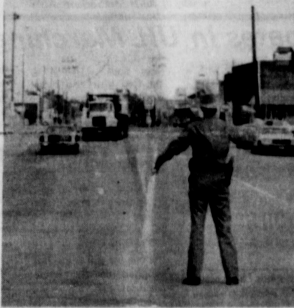
DPS PATROLMAN, JOHN Holland directs traffic on Interstate 40. Traffic had to be re-routed through McLean Monday after a truck pulled down more than 600 feet of telephone cable, stringing the cable across the Interstate.

A high-loaded truck, traveling down I-40 apparently pulled down a 900 pair telephone cable Monday afternoon, resulting in approximately 225 McLean telephone circuits being disconnected.