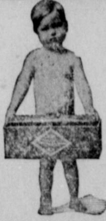
Here is Your Burner. Lady! Take it

Don't fail to see the Success Oil Burner. It will save you 50 per cent on your fuel bills. There is no ashes to bother nor kindling and coal to carry. Price $10