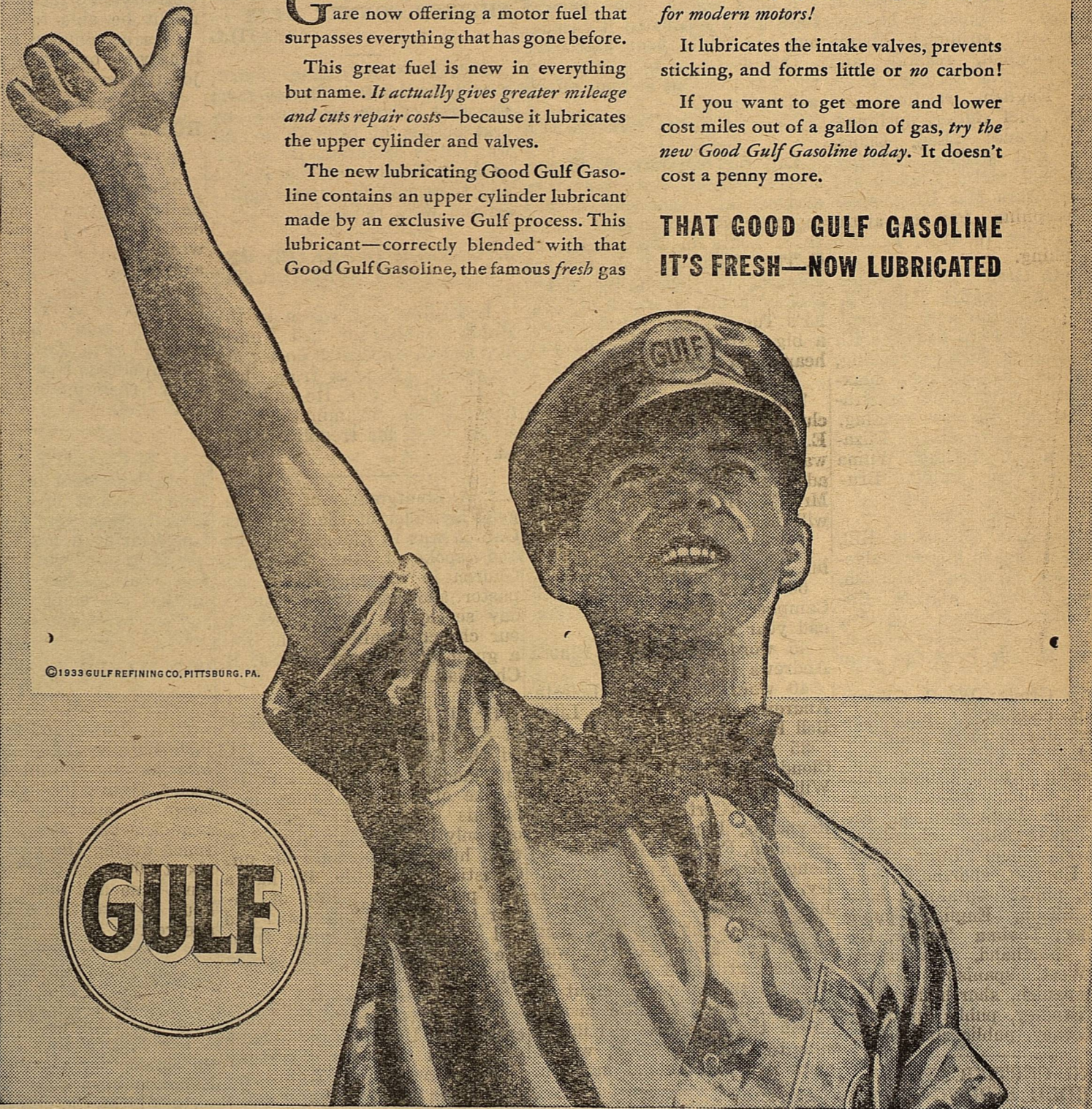
©1933 GULF REFINING CO., PITTSBURG, PA.

THAT GOOD GULF GASOLINE IT'S FRESH—NOW LUBRICATED