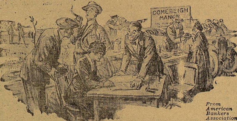
From American Bankers Association Journal

this same shylock for assistance and this is how he handled the case. He led the woman to expect that he would lend her the money but kept deferring making the loan from day to day. Finally, on the day she must make her payment or lose her furniture, he