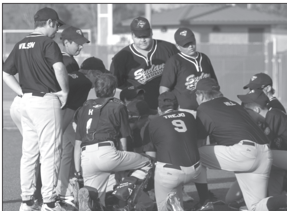
The team huddles together during a time out.