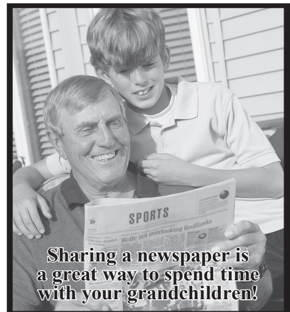
Sharing a newspaper is a great way to spend time with your grandchildren!