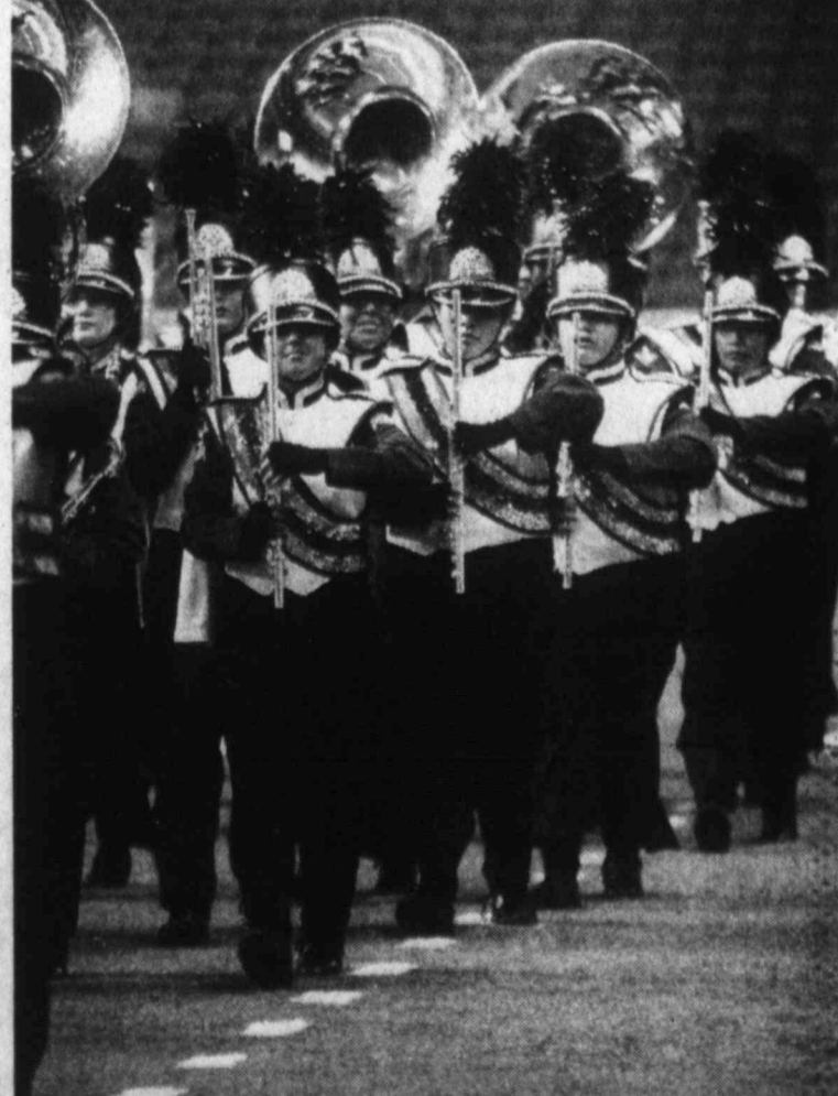
State Contest