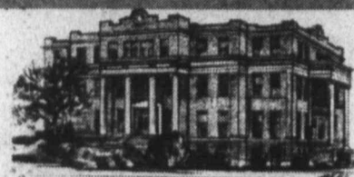
Courthouse built in 1918