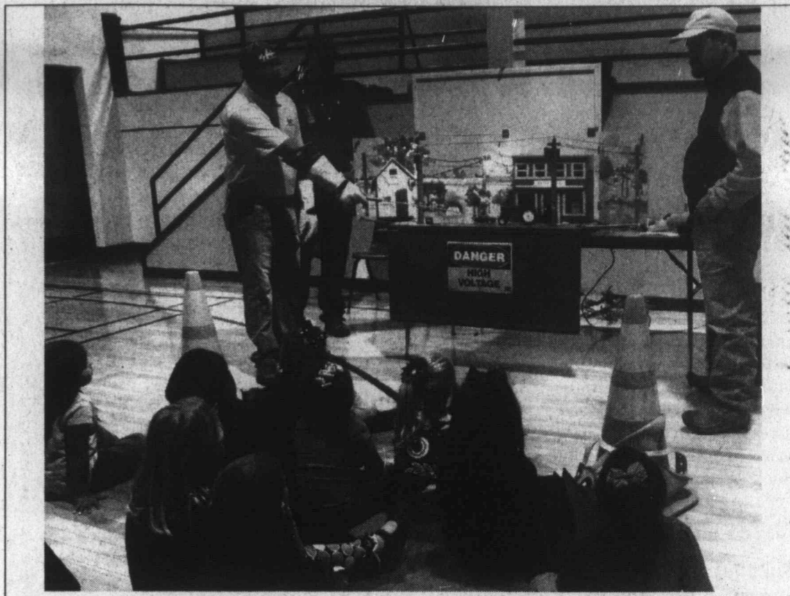
Safety first ... Lyntegar Electric Cooperative employees showed Tahoka Elementary children the dangers of electricity and how to be safe during the Oct. 27 Health Fair sponsored by Lynn County Hospital District. Several local agencies manned booths at the elementary school for the Health Fair, providing information about safety and good health practices.

For more information on sales closing dates and NAP, contact the Lynn County FSA office at 806-998-4501.